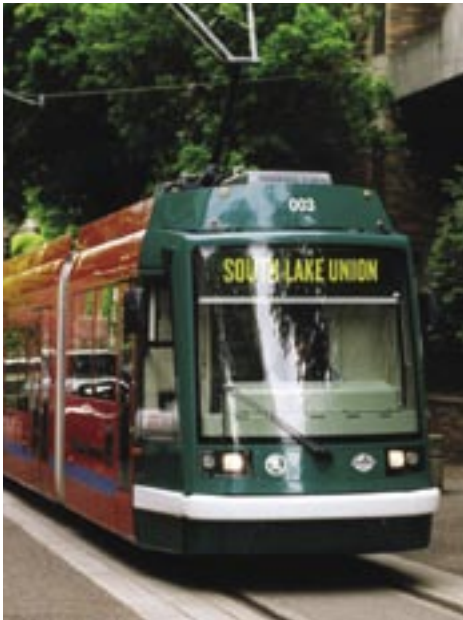
South Lake Union Streetcar

First off, I'm moving to a downtown Seattle neighborhood – South Lake Union, to be exact. There, I'll be able to walk or bike nearly everywhere I need to go – work, parks, restaurants, shops. Makes my feet want to do a little happy dance.