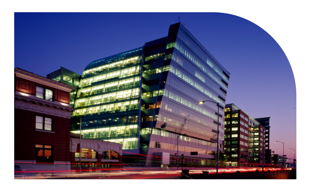
*FIrs 3-5 can be combined for 72,981 RSF

Located in Chinatown-International District, immediately south of the financial core, this 11-story, 2009-2010 BOMA Office of the Year Building features an iconic "glass waterfall" design and state-of-the-art building systems.