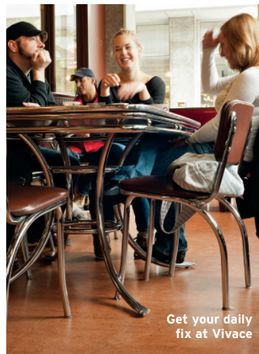
Get your daily fix at Vivace