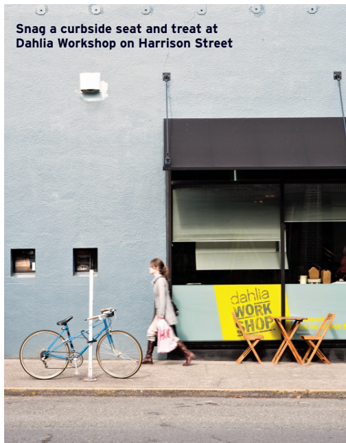
Snag a curbside seat and treat at Dahlia Workshop on Harrison Street

The streets buffering the Westlake Avenue corridor are tidy, polished and clean—like, Disneyland clean—including the manicured new LAKE UNION PARK LAWN (860 Terry Ave. N; 206.684.7254; seattle.gov/parks/parkspaces/lakeunion-park.htm) at the south shore of Lake Union, adjacent to the old armory (which will soon house the relocated Museum of History & Industry). Two other urban miracles have occurred here: There is plenty of easy, free street parking in the evening, and we've never been so happy to see our tax dollars at work—people actually ride the SLUT streetcar now!