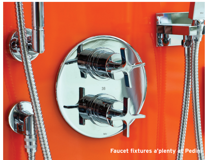
Faucet fixtures a plenty at Pedini