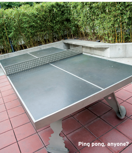
Ping pong, anyone?