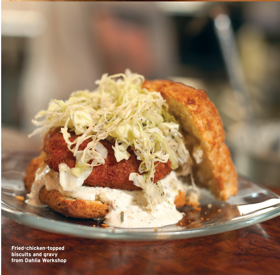
Fried-chicken-topped biscuits and gravy from Dahlia Workshop