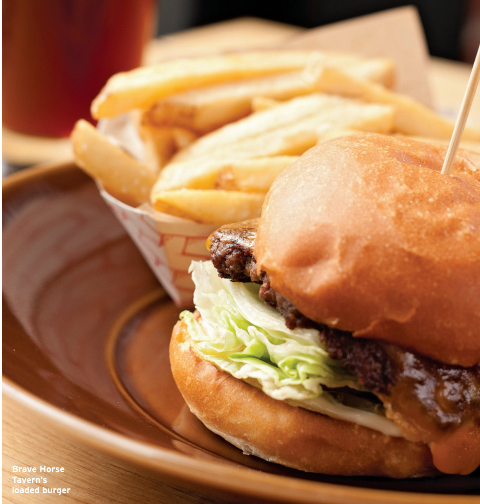
Brave Horse Tavern's loaded burger