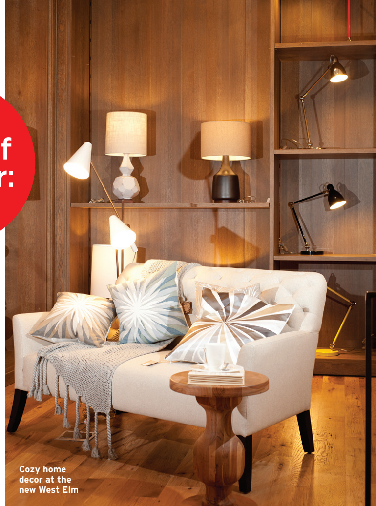
Cozy home decor at the new West Elm