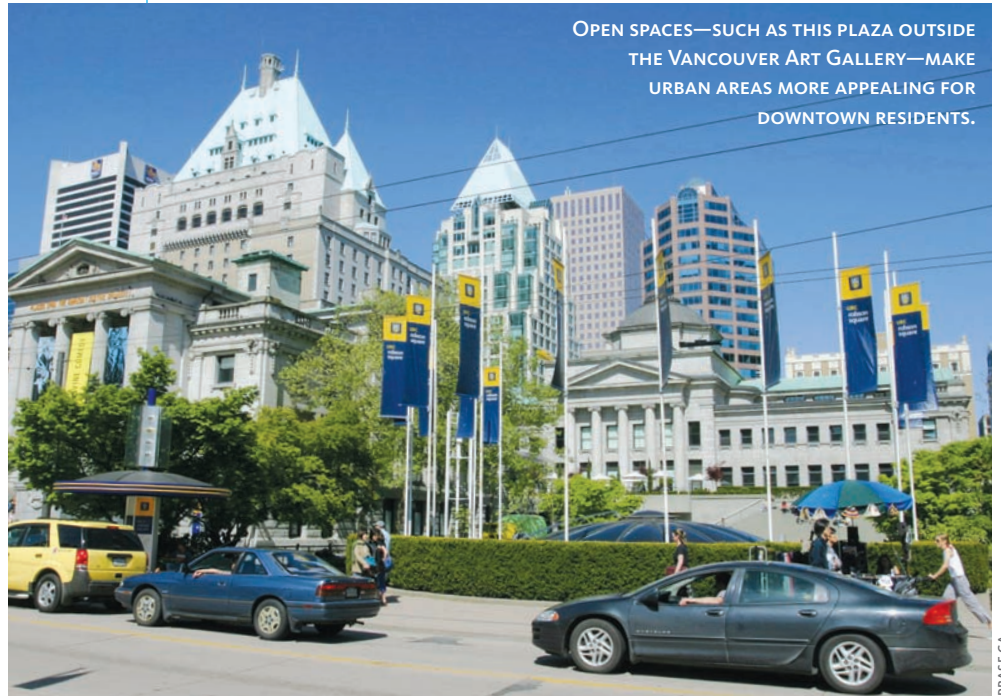
OPEN SPACES—SUCH AS THIS PLAZA OUTSIDE THE VANCOUVER ART GALLERY—MAKE URBAN AREAS MORE APPEALING FOR DOWNTOWN RESIDENTS.