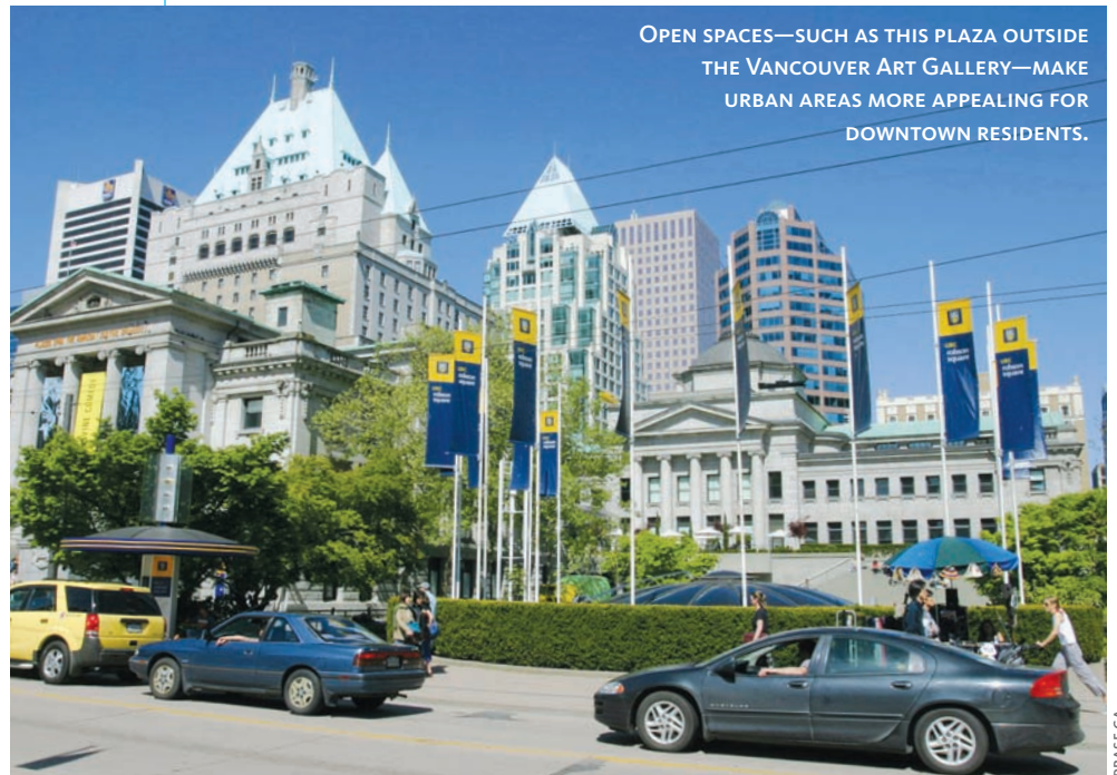
OPEN SPACES—SUCH AS THIS PLAZA OUTSIDE THE VANCOUVER ART GALLERY—MAKE URBAN AREAS MORE APPEALING FOR DOWNTOWN RESIDENTS.